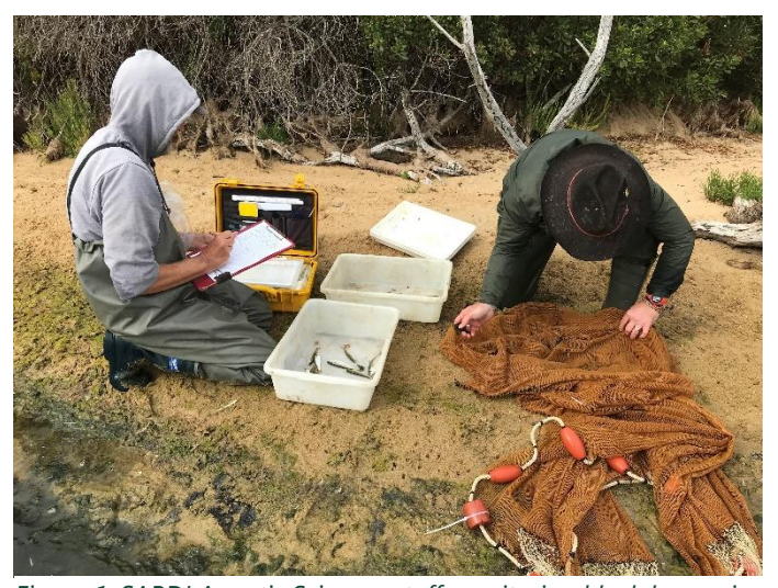
Figure 1: SARDI Aquatic Sciences staff monitoring black bream in the Coorong

Coorong fish monitoring is managed by the Department for Environment and Water, and funded by The Living Murray program, a joint initiative of the New South Wales, Victorian, South Australian and Commonwealth governments coordinated by the Murray-Darling Basin Authority.