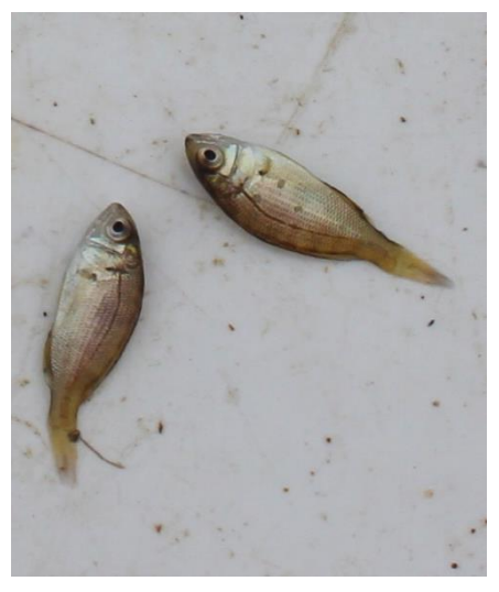
Figure 2: Baby black bream found in the Coorong (A. Rumbelow)